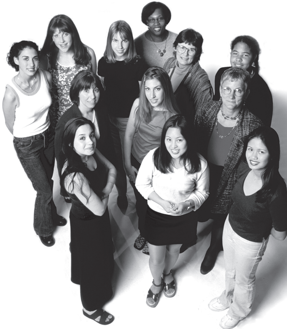
Dr. Anita Borg (1949—2003) with students and researchers who carry on her vision.

Recruiting, retaining, and developing female leaders in high-tech fields.